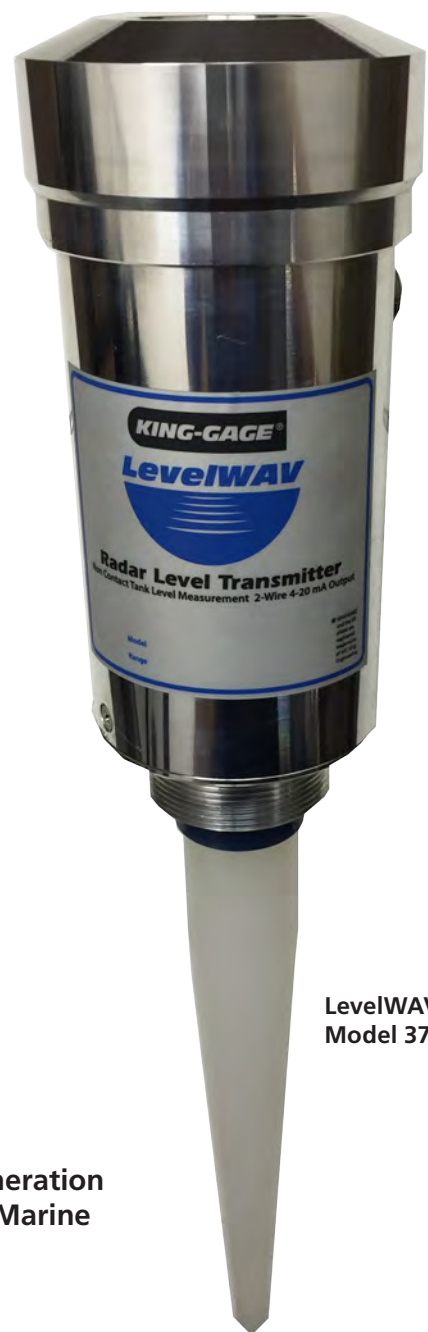
LevelWAV Model 3700

The compact size and mounting footprint makes tank top mounting of the LevelWAV radar transmitter suitable for even tight spaces. Radar level measurement is a practical solution in retrofit applications to replace failing or erratic level transmitters. Model offerings include sanitary configurations with stainless steel construction and food-grade PTFE antenna cover.